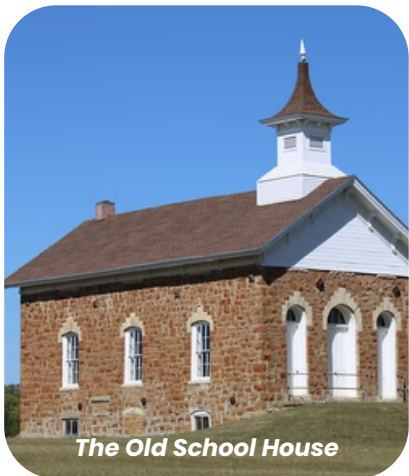
The Old School House