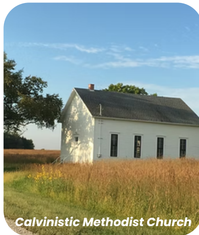
Calvinistic Methodist Church