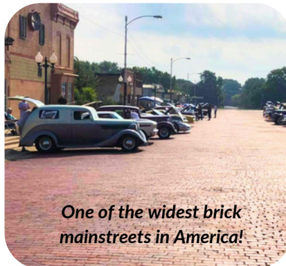
One of the widest brick mainstreets in America!